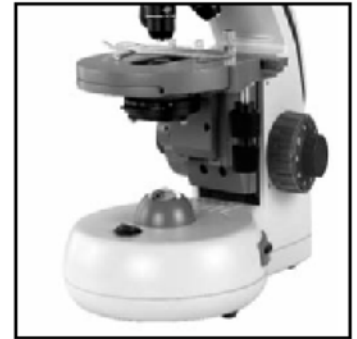
Contemporary design, rounded base and built-in mechanical stage