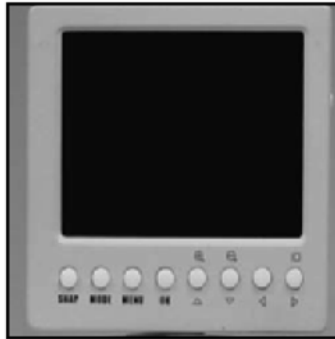
Built-in digital camera and 3" LCD screen