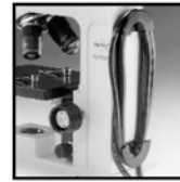
No hassle cord storage (M2251B, M2251F, M2251CL)