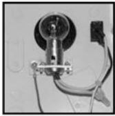
120V, 20W tungsten illumination (M2251B)