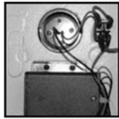
Cordless rechargeable LED illumination (M2251C)