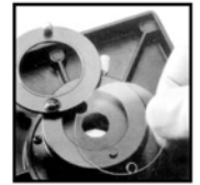
Protective iris diaphragm shield (M2251C, M2251CL)