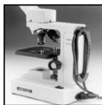
"No hassle" cord storage