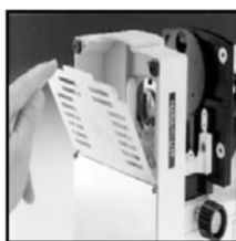
Easy bulb replacement