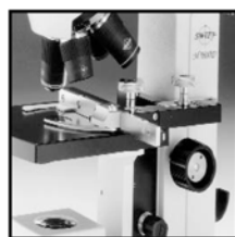
High-drive mechanical stage (MA12005)