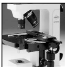
Low-drive mechanical stage (MA12006)