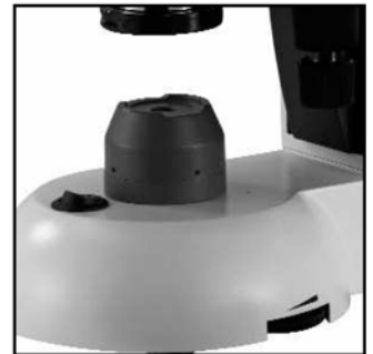
Variable illumination intensity control

Modern Finish: Unless otherwise indicated, all instruments are finished in acid and reagent resistant, Swift epoxy-ester resin.