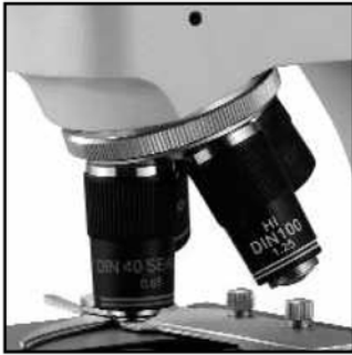
High quality semi-plan objectives